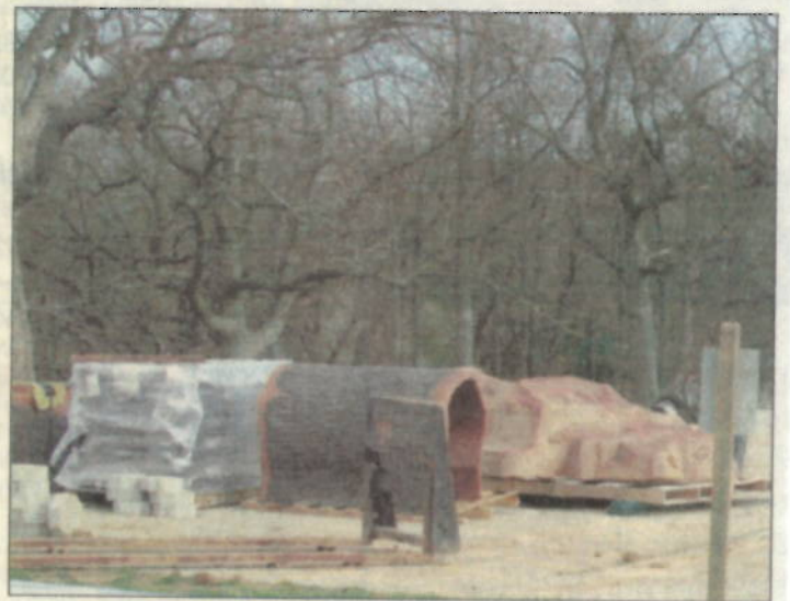
KORTH PARK PLAYGROUND – The Korth Park playground is almost set to go, as one can see by the photos above.