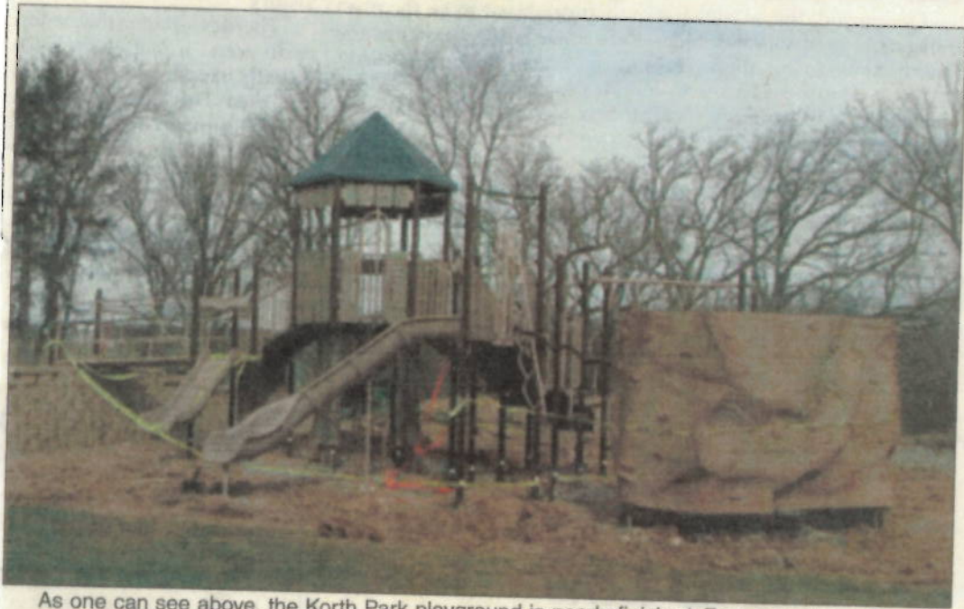
As one can see above, the Korth Park playground is nearly finished. For more photos from the playground go to page 16.